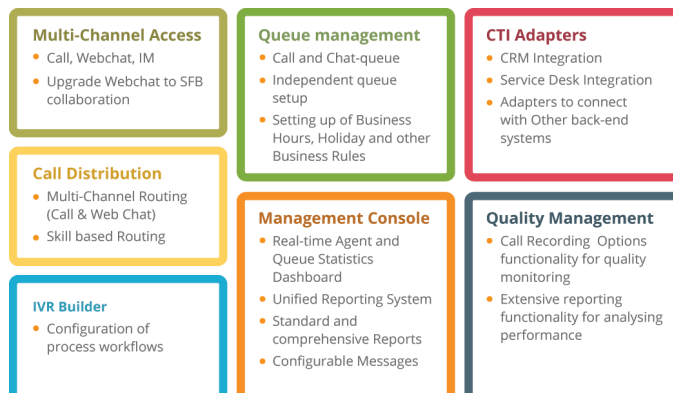
Sensible's Unified Contact Center suite